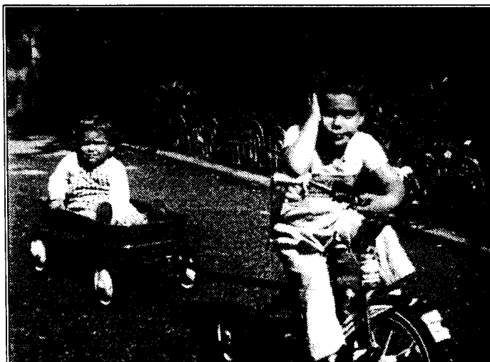
The editor (and his sister) c. 1966