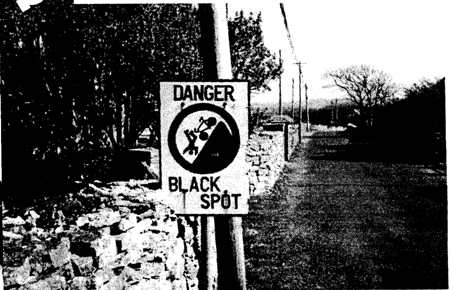
OK, does anyone know what this sign means?